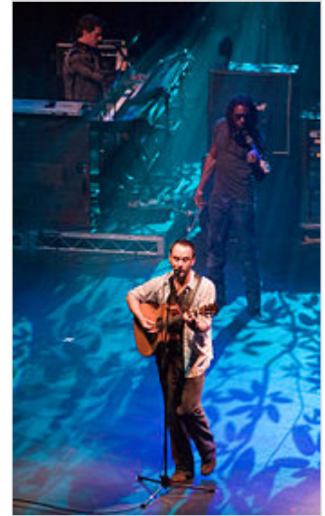
Dave Matthews, Boyd Tinsley, and Butch Taylor in Melbourne during their first tour of Australia