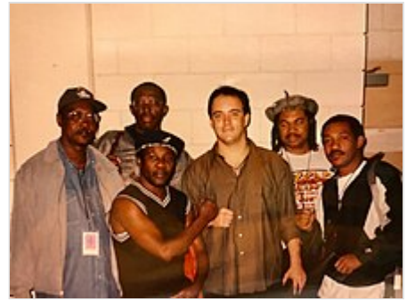
Too ts and the Maytals with Dave Matthews when performing together in 1998

In 2000, DMB set up their own recording studio at a large countryside home outside Charlottesville. With longtime producer Lillywhite at the helm, the band began work on a fourth studio album. The songs were heavily influenced by personal conflicts, notably the death of Matthews's uncle from alcoholism.