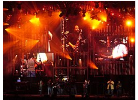
Dave Matthews Band performing "Last Stop" at The Pavilion on July 5, 2006