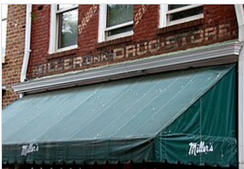
Miller's Bar on the Downtown Mall in Charlottesville