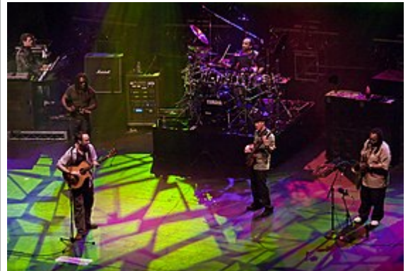
Dave Matthews Band performing in 2005. From left to right: Taylor , Tinsley , Matthews , Beauford , Lessard , Moore