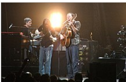
Dave Matthews Band performing at Vodafone Arena in Melbourne on May 1, 2007, starting their second tour of Australia.

According to Billboard magazine, the band's new album had been scheduled to be released in July by RCA Records , [38] but in an interview with the Brisbane Times on May 4, 2007, Stefan Lessard stated, "We're on a bit of a creative break as far as working in the studio – we've been in pre-production for a long time, but we'll get more serious later in the year." [39]