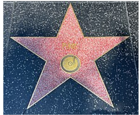
Pink's star of the Hollywood Walk of Fame at 6801 Hollywood Boulevard

scored a breakout hit, challenging a school of teen singers to find their own sounds as well." He adds, "[Pink] also started a race among other teen pop stars like Christina Aguilera to add substance to their own sound." [166] Ann Powers refers to her as a "powerhouse vocalist", stating her mix of rebellion, emotional rawness, humor, and "infectious" dance beats created "a model for the mashup approach of latter-day divas such as Katy Perry , Kesha , and Rihanna ." [173] Rob Sheffield of Rolling Stone commented: "I think people respond to her sense of independence and dedication. It inspires people... This is a prolific pop artist who is sometimes famous and successful, sometimes obscure, who nonetheless keeps making her own kind of music." [173]