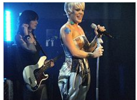
Pink at a London performance to promote the Funhouse album, November 2008

On August 7, 2008, Pink's single "So What" was leaked online, and radio stations across Australia were quick to give it massive airplay. Less than six hours after the leak, "So What" was voted No. 1 on Nova 100 Melbourne and shot to No. 1 on the Today Network's national radio Hot30 Countdown . [62] On August 22, Pink announced a new track, titled "Crystal Ball" . On September 18, 2008, "So What" became her second number-one hit on the Billboard Hot 100 . [63] Pink was the guest of honor at the 2008 ARIA Music Awards, which were held in Sydney, Australia, in October 2008. There she sang "So What" . On November 3, 2008, Funhouse debuted at No. 1 on the ARIA charts. In Australia it sold over 86,000 units in its first week, and was eventually certified eleven times platinum. [64]