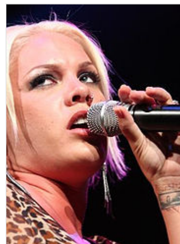
Pink performing in 2006

In mid-2003, Pink contributed the song " Feel Good Time " to the soundtrack of the film Charlie's Angels: Full Throttle , in which she had a cameo appearance as a motocross race ramp owner/promoter. Featuring electronic music artist William Orbit , it became Pink's first single to miss the top 40 on Billboard's Hot 100 chart, although it was a hit in Europe and in Australia. It was later included on non-US editions of Pink's third album, Try This , which was released on November 11, 2003. Eight of the 13 tracks were co-written with Tim Armstrong of the band Rancid . Linda Perry was featured on the album as a writer and musician. Despite the album reaching the top ten on album charts in the US, in Canada, in the UK, and in Australia, sales were considerably lower than those of Missundaztood . However, it did go platinum in the US. The singles " Trouble " and " God Is a DJ " did not reach the US top 40 but did reach the top ten in other countries, and " Last to Know " was released as a single outside North America. " Trouble " earned Pink the Grammy award in Best Female Rock Vocal Performance category at the 46th Annual Grammy Awards , and " Feel Good Time " was nominated for Best Pop Collaboration with Vocals . [44] She toured extensively on the Try This Tour through Europe and Australia, where the album was better received.