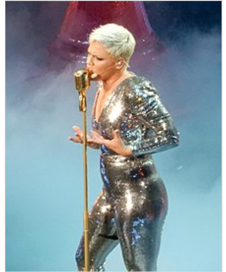
Pink performing at Madison Square Garden in 2018

" Setting the World on Fire " which was released on August 1, 2016. The single topped on the Billboard Hot Country Songs and went platinum in the United States and Canada. [121][122][123] On March 10, 2017, Pink teamed up with Stargate and Australian star Sia on the former's debut single, " Waterfall ".