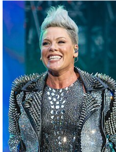
Pink performing in 2024