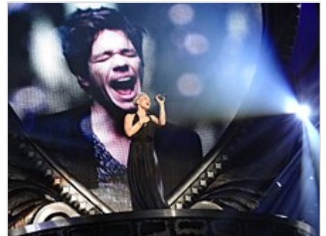
Pink performing " Just Give Me a Reason " with Nate Ruess in 2013

" Try " was released as the second single from The Truth About Love in October 2012 and became a worldwide top-ten hit, peaking at number nine on the Billboard Hot 100. In February 2013, Pink released the fourth single, " Just Give Me a Reason ", featuring guest vocals by Nate Ruess of Fun . It became the most successful single from The Truth About Love , topping the record charts in more than 20 countries worldwide and becoming Pink's fourth number-one hit on the Billboard Hot 100. According to the IFPI, the song was the fourth best-selling digital single of 2013 with 9.9 million copies sold worldwide. [90] The song won the Billboard Mid-Year Award for Favorite Hot 100 No. 1 Song, and garnered two nominations for Best Pop Duo/Group Performance and Song of the Year at the 56th Annual Grammy Awards . [91] Three further singles, " True Love ", " Walk of Shame ", and " Are We All We Are ", was released throughout 2013 to less commercial success. On February 13, 2013, Pink kicked off her sixth tour, known as The Truth About