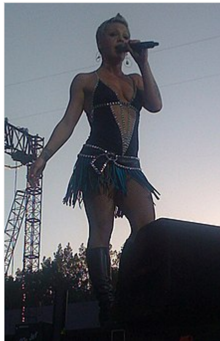
Pink performing at Main Square Festival in 2010

In the first week of October 2010, Pink released " Raise Your Glass ", the first single from her first compilation album, Greatest Hits... So Far!!! . The song celebrates a decade of solo work, and is dedicated to her fans who have been supporting her over the years. The song reached the top of the Billboard Hot 100, becoming Pink's tenth Top 10 hit, and her third number-one on the chart. [78] She released the compilation album on November 12, 2010, and almost a month later she released the album's