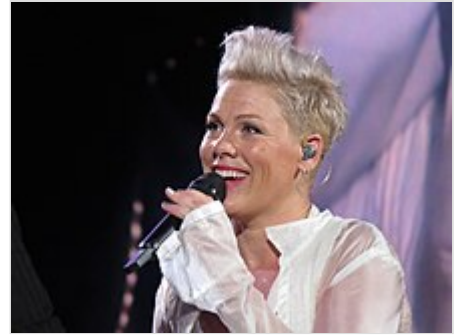
Pink at Olympiastadion , Munich, in 2019

On February 5, 2019, Pink received a star on the Hollywood Walk of Fame ; [138] she further announced the release of her eighth album, Hurts 2B Human , which was released on April 26, 2019. The album's lead single, " Walk Me Home " was released on February 20, 2019. [139][140] On the release date, Pink performed the song alongside a medley of her biggest hits at the BRIT Awards , including " Try ", " Just Give Me a Reason ", with fun. lead singer Nate Ruess, and " What About Us ". She was also awarded with the Outstanding Contribution to Music Award at the ceremony. [141][142] In December 2019, Pollstar named her Artist of the Year. [143] Pink confirmed that in 2020 she will take a break from music to focus on her family. [144] On September 16, 2020, she released " One Too Many ", a collaboration with Keith Urban for his album " The Speed of Now Part 1 ". [145]