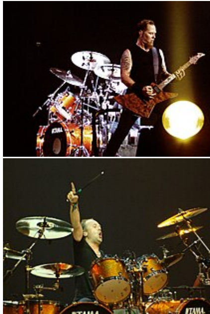
Metallica founding members James Hetfield (top) and Lars Ulrich (bottom)