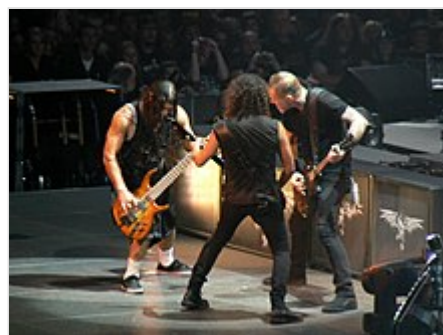
Metallica performing in Sacramento in 2009

On November 9, 2010, Metallica announced it would be headlining the Rock in Rio festival in Rio de Janeiro on September 25, 2011. [106][107] On December 13, 2010, the band announced it would again play as part of the "big four" during the Sonisphere Festival at Knebworth House , Hertfordshire, on July 8, 2011. It was the first time all of the "big four" members played on the same stage in the UK. [108] On December 17, 2010, Another "big four" Sonisphere performance that would take place in France on July 9 was announced. [109] On January 25, 2011, another "big four" performance on April 23, 2011, at the Empire Polo Club in Indio, California , was announced. It was the first time all of the "big four" members played on the same stage in the U.S. [110] On February 17, 2011, a show in Gelsenkirchen , Germany, on July 2, 2011, was announced. [111] On February 22, a "big four" show in Milan on July 6, 2011, was announced. [112] On March 2, 2011, another "big four" concert, which took place in Gothenburg on July 3, 2011, was announced. [113] The final "big four" concert was in New York City, at Yankee Stadium, on September 14, 2011. [114]