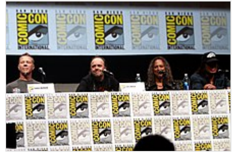
Metallica at the San Diego Comic-Con International in 2013

In an interview with Classic Rock on January 8, 2013, Ulrich said regarding the band's upcoming album, "What we're doing now certainly sounds like a continuation [of Death Magnetic ]". He also said, "I love Rick [Rubin]. We all love Rick. We're in touch with Rick constantly. We'll see where it goes. It would stun me if the record came out in 2013." [140] Also in 2013, the band starred in a 3D concert film titled Metallica: Through the Never , which was directed by Antal Nimród and was released in IMAX theaters on September 27. [141]