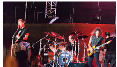
Metallica performing in Bangalore in 2011

On February 7, 2012, Metallica announced that it would start a new music festival called Orion Music + More , which took place on June 23 and 24, 2012, in Atlantic City. Metallica also confirmed that it would headline the festival on both days and would perform two of its most critically acclaimed albums in their entirety: The Black Album on one night, and Ride the Lightning on the other. [132] In a July 2012 interview with Canadian radio station 99.3 The Fox , Ulrich said Metallica would not release its new album until at least early 2014. [133]