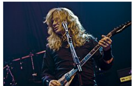
Dave Mustaine (pictured in 2009) went on to found rival band Megadeth after being fired from the band in 1983.