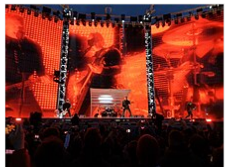
Metallica performing in Milan in 2019