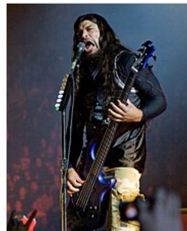
Robert Trujillo joined Metallica in 2003 after the recording of St. Anger .