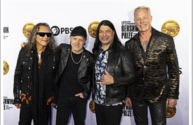
Metallica at the 2024 Gershwin Prize ceremony. From left to right: Kirk Hammett , Lars Ulrich , Robert Trujillo and James Hetfield .