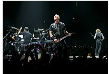
Metallica performing in London in 2017

In an interview with Australian magazine The Music 's official podcast in March 2019, Trujillo said that Metallica had begun jamming on new material for its next studio album. "I'm excited about the next record because I believe it will also be a culmination of the two [previous] records and another journey. There's no shortage of original ideas, that's the beauty of being in this band." He estimated that the album would be released "a lot sooner than the previous two did... this time around I think we'll be able to jump on it a lot quicker and jump in the studio and start working. We've all vowed to get this one going sooner than later." [171] In an interview with Australian magazine Mixdown the following month, Hammett said that the band had tentative plans to enter the studio after the conclusion of its WorldWired Tour. He stated, "We're in our third year since Hardwired . Maybe we can get a bit more focus and go into the studio a bit sooner." After not contributing any writing to Hardwired... to Self-Destruct , Hammett said regarding his ideas for the new album, "I have a ton of material. I've over-compensated, so I'm ready to go anytime." [172]