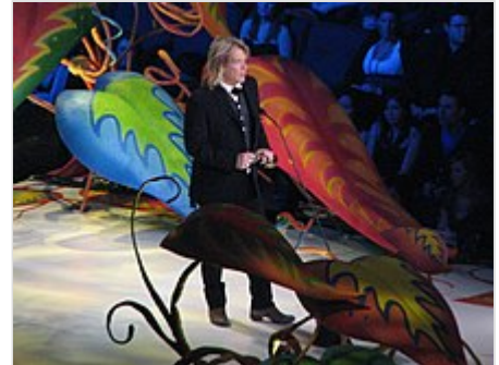
Longtime producer Bob Rock recorded bass for St. Anger following Newsted's departure in 2001.

Newsted left Metallica on January 17, 2001, just as plans were being made to enter the recording studio. He said he left the band for "private and personal reasons, and the physical damage I have done to myself over the years while playing the music that I love." [67] During a Playboy interview with Metallica, Newsted said he wanted to release an album with his side project , Echobrain . Hetfield was opposed to the idea and said, "When someone does a side project, it takes away from the strength of Metallica" and that a side project is "like cheating on your wife in a way." [55] Newsted said Hetfield had recorded vocals for a song used in the film South Park: Bigger, Longer & Uncut , and appeared on two Corrosion of Conformity albums. Hetfield replied: "My name isn't on those records. And I'm not out trying to sell them" and raised questions such as, "Where would it end? Does he start touring with it? Does he sell shirts? Is it his band?" [55]