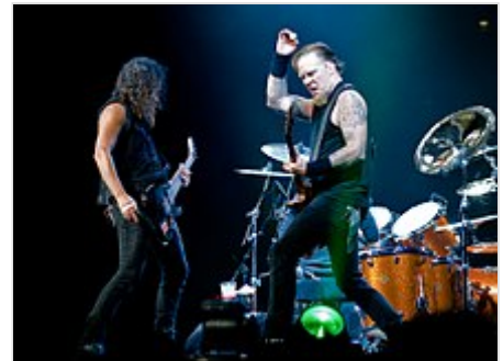
Metallica performing in London in 2008

Metallica scheduled the release of the album Death Magnetic as September 12, 2008, and the band filmed a music video for the album's first single, " The Day That Never Comes ". On September 2, 2008, a record store in France began selling copies of Death Magnetic nearly two weeks before its scheduled worldwide release date, [83] which resulted in the album being made available on peer-to-peer clients. This prompted the band's UK distributor Vertigo Records to officially release the album on September 10, 2008. Rumors of Metallica or Warner Bros. taking legal action against the French retailer were unconfirmed, though drummer Lars Ulrich responded to the leak by saying, "...We're ten days from release. I mean, from here, we're golden. If this thing leaks all over the world today or tomorrow, happy days. Happy days. Trust me", [84] and, "By 2008 standards, that's a victory. If you'd told me six months ago that our record wouldn't leak until 10 days out, I would have signed up for that." [85]