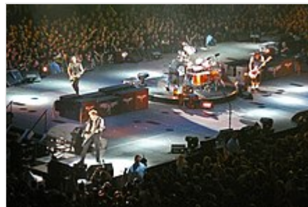
Metallica performing in London in 2009

Metallica, Slayer, Megadeth, and Anthrax performed on the same bill for the first time on June 16, 2010, at Warsaw Babice Airport , Poland, as a part of the Sonisphere Festival series. The show in Sofia, Bulgaria, on June 22, 2010, was broadcast via satellite to cinemas. [97] The bands also played concerts in Bucharest on June 26, 2010, and Istanbul on June 27, 2010. On June 28, 2010, Death Magnetic was certified double platinum by the RIAA . [98] Metallica's World Magnetic Tour ended in Melbourne on November 21, 2010. The band had been touring for more than two years in support of Death Magnetic . To accompany the final tour dates in Australia and New Zealand, a live, limited edition EP of past performances in Australia called Six Feet Down Under was released. [99] The EP was followed by Six Feet Down Under (Part II) , which was released on November 12, 2010. [100] Part 2 contains a further eight songs recorded during the first two Oceanic Legs of the World Magnetic Tour. On November 26, 2010, Metallica released a live EP titled Live at Grimey's , which was recorded in June 2008 at Grimey's Record Store, just before the band's appearance at Bonnaroo Music Festival that year. [101][102]