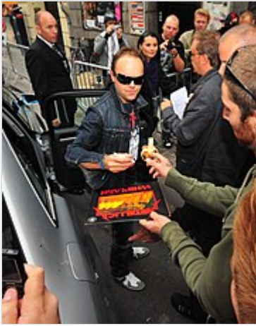
Lars Ulrich led the case against Napster for Metallica.

Ulrich provided a statement to the Senate Judiciary Committee regarding copyright infringement on July 11, 2000. [60] Federal Judge Marilyn Hall Patel ordered the site to place a filter on the program within 72 hours or be shut down. [62] A settlement between Metallica and Napster was reached when German media conglomerate Bertelsmann BMG showed interest in purchasing the rights to Napster for $94 million. Under the terms of settlement, Napster agreed to block users who shared music by artists who do not want their music shared. [63] On June 3, 2002, Napster filed for Chapter 11 protection under U.S. bankruptcy laws. On September 3, 2002, an American bankruptcy judge blocked the sale of Napster to Bertelsmann and forced Napster to liquidate its assets, according to Chapter 7 of the U.S. bankruptcy laws. [64]