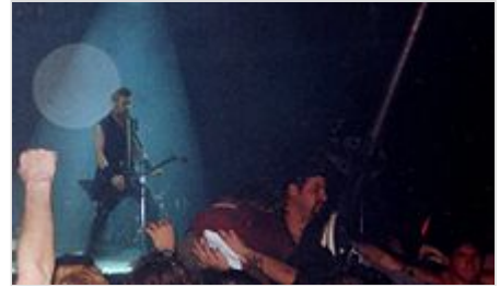
James Hetfield performing with the band during its tour for Load in 1996

After almost three years of touring to promote Metallica , including a headlining performance at Woodstock '94 , Metallica returned to the studio to write and record its sixth studio album. The band went on a brief hiatus in the summer of 1995 and played a short tour, Escape from the Studio '95 , which comprised three outdoor shows, including a headline show at Donington Park supported by Slayer , Skid Row , Slash's Snakepit , Therapy? and Corrosion of Conformity . The band spent about a year writing and recording new songs, resulting in the release of Load in 1996. Load debuted at number one on the Billboard 200 and ARIA Charts ; it was the band's second number one album. [28]