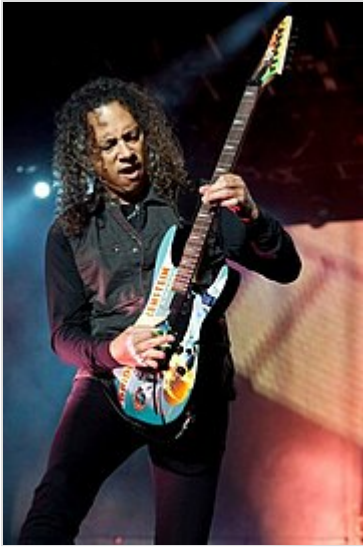
Kirk Hammett (pictured in 2010) replaced Mustaine in 1983, and has been with the band ever since.

Because of conflicts with its record label and the distributors' refusal to release an album titled Metal Up Your Ass , the album was renamed Kill 'Em All . It was released on Megaforce Records in the U.S. and on Music for Nations in Europe, and peaked at number 155 on the Billboard 200 in 1986. [24][a] Although the album was not initially a financial success, it earned Metallica a growing fan base in the underground metal scene. [25] To support the release, Metallica embarked on the Kill 'Em All for One tour with Raven . [26] In February 1984, Metallica supported Venom on the Seven Dates of Hell tour, during which the bands performed in front of 7,000 people at the Aardschok Festival in Zwolle , Netherlands. [27]