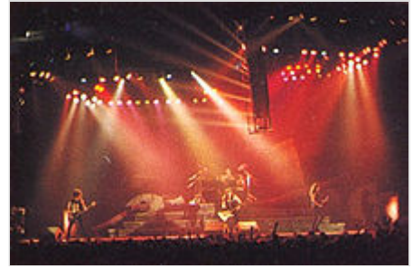
Metallica performing during its Damaged Justice Tour in 1988

In 1989, Metallica received its first Grammy Award nomination for ...And Justice for All in the new Best Hard Rock/Metal Performance Vocal or Instrument category. Metallica was the favorite to win, but the award was given to Jethro Tull for the album Crest of a Knave . [42] The award was controversial with fans and the press; Metallica was standing off-stage waiting to receive the award after performing the song " One ". Jethro Tull had been advised by its manager not to attend the ceremony because he was expecting Metallica to win. [42] The award was named in Entertainment Weekly's " Grammy's 10 Biggest Upsets " list. [43]