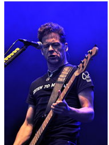
Jason Newsted (pictured in 2013) joined Metallica soon after Cliff Burton's death in 1986.

Burton's death left Metallica's future in doubt. The three remaining members decided Burton would want them to carry on, and with the Burton family's blessings, the band sought a replacement. [35] Roughly 40 people – including Hammett's childhood friend, Les Claypool of Primus ; Troy Gregory of Prong ; and Jason Newsted , formerly of Flotsam and Jetsam – auditioned for the band to fill Burton's spot. Newsted learned Metallica's entire setlist; after the audition, Metallica invited him to Tommy's Joynt in San Francisco. Hetfield, Ulrich and Hammett decided on Newsted as Burton's replacement; his first live performance with Metallica was at the Country Club in Reseda, California . The members initiated Newsted by tricking him into eating a ball of wasabi . [35] The band finished its tour in February 1987.