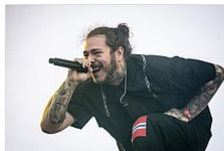
Malone performing on the main stage at Stavernfestivalen in Stavern , Norway in 2018

Malone was nominated for 4 awards at the 61st Grammy Awards for his album Beerbongs & Bentleys . Among the nominations were Album of the Year and Record of the Year. He performed with the Red Hot Chili Peppers at the awards show on February 10, 2019. [86][87] In July 2019, Malone released the single "Goodbyes" (featuring Young Thug), and also announced the Runaway Tour with Swae Lee as the opener. [88] On August 5, Malone shared a snippet of an unreleased track "Circles" on YouTube. He then