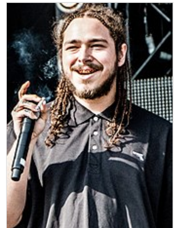
Malone at the VELD Music Festival in Canada in 2016