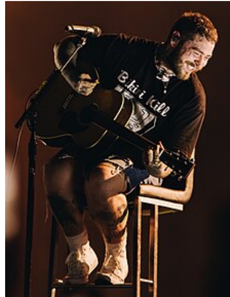
Malone performing in 2021