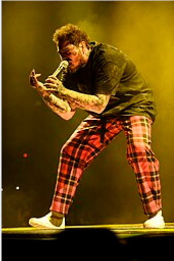
Malone performing in Rosemont, Illinois in February 2020

On March 12, 2020, Malone's concert at Denver's Pepsi Center proceeded as scheduled, drawing a sellout-crowd of 20,000, likely the last large-scale enclosed gathering in the U.S. before COVID-19 pandemic lockdowns . [96] Malone received backlash for not cancelling his sold-out arena show amid rising concerns over the COVID-19 pandemic . [97][98] Reportedly, future U.S. tour dates in March were postponed by Live Nation on March 12, 2020. [99][100]