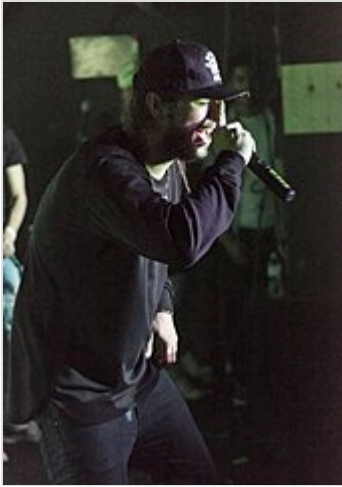
Malone performing in 2015

At age 17, Malone released a parody synth-pop ballad song called "Why Don't You Love Me" under the alias Leon DeChino , intended for a school project. The song reappeared online in 2016. Malone later referenced the DeChino alias on his song "Psycho". [30][31]