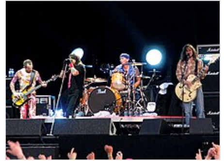
Red Hot Chili Peppers performing at the Pinkpop Festival in 2006

2006, breaking multiple records by 2007. The song became their eleventh number-one single, giving the band a cumulative total of 81 weeks at number one. It was also the first time three consecutive singles by the band made it to number one. " Desecration Smile " was released internationally in February 2007 and reached number 27 on the UK charts. " Hump de Bump " was planned to be the next single for the US, Canada, and Australia only, but due to positive feedback from the music video, it was released as a worldwide single in May 2007.