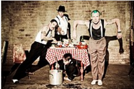
A 2012 promotional image of the Red Hot Chili Peppers

Red Hot Chili Peppers recorded their tenth album, I'm with You , between September 2010 and March 2011. They decided against releasing another double album, reducing the album to 14 tracks. [126] I'm with You was released in the US in August 2011. It topped the charts in 18 countries, and received mostly positive reviews. " The Adventures of Rain Dance Maggie ", became the band's 12th number-one single. [127][128] " Monarchy of Roses ", " Look Around " and " Did I Let You Know " (released only in Brazil), and " Brendan's Death Song " were also released as singles. [129]