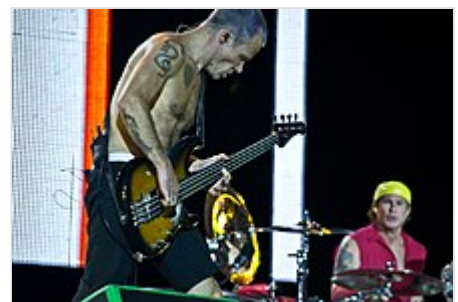
Flea and Smith at Rock in Rio Madrid 2012

The Chili Peppers were nominated for two MTV Europe Music Awards for Best Rock Band and Best Live Artist [133] and nominated for Best Group at the 2012 People's Choice Awards [134] I'm with You was also nominated for a 2012 Grammy Award for Best Rock Album . [135] In April 2012, the Chili Peppers were inducted into the Rock and Roll Hall of Fame . May saw the release of the download-only Rock & Roll Hall of Fame Covers EP , comprising previously released studio and live covers of artists that had influenced the band. From August 2012, the band began releasing a series of singles as the I'm with You Sessions , which were compiled on the I'm Beside You LP in November 2013 as a Record Store Day exclusive. [136]