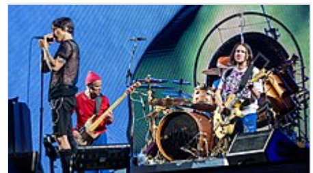
The band performing in July 2023

The 12th Red Hot Chili Peppers album, Unlimited Love , produced by Rubin, was released on April 1, 2022. It debuted at number one in ten countries, becoming the first US number-one Chili Peppers album since Stadium Arcadium . [176] It was promoted with the singles "Black Summer" [177] and "These Are the Ways". [178] NME wrote that Unlimited Love shared the "melancholic riffmaking, anthemic choruses and softly-sung melodies" of Frusciante's previous work with the Chili Peppers, but introduced new "grungy" and acoustic elements. [179]