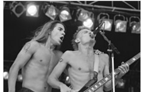
Vocalist Anthony Kiedis and bassist Flea (pictured in August 1989) have remained with the Red Hot Chili Peppers through the band's history.