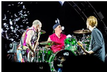
The Red Hot Chili Peppers performing at Rock am Ring in 2016

the songs were influenced by a two-year relationship that fell apart. [143] "Dark Necessities" became the band's 25th top-ten single on the Billboard Alternative Songs chart, a record they hold over U2. [144] In February 2016, "Circle of the Noose", an unreleased song recorded with Navarro in 1998, was leaked. [145]