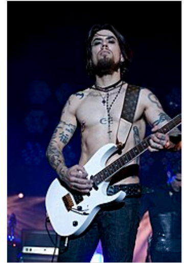
Dave Navarro (pictured in 2009) replaced Jesse Tobias as guitarist in 1993. He left in 1998.

One Hot Minute was released in September 1995 after several delays. It departed from the Chili Peppers' previous sound, with Navarro's guitar work incorporating heavy metal riffs and psychedelic rock. [79] The band described it as a darker, sadder record. [80] Kiedis's lyrics addressed drugs, including the lead single, "Warped", and broken relationships and deaths of loved ones, including "Tearjerker", written about Kurt Cobain and "Transcending" about River Phoenix. Despite mixed reviews, the album sold eight million copies worldwide. [81] The band also contributed to soundtracks including Working Class Hero: A Tribute to John Lennon [82] and Beavis and Butt-Head Do America , [83] and Flea and Navarro contributed to Alanis Morissette's single "You Oughta Know". [84]