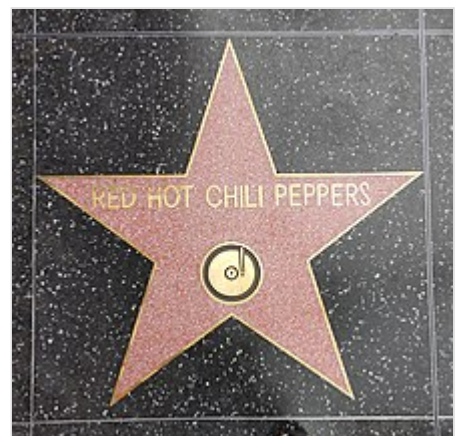
The Red Hot Chili Peppers' star on the Hollywood Walk of Fame , unveiled in March 2022

The members of Korn , who were formerly in the funk metal band L.A.P.D. , have also cited them as an influence. [262] Kiedis said the band were early to combine "hardcore funk and hip-hop-style vocals", and suggested they had influenced Limp Bizkit , Kid Rock , and Linkin Park . [263] Smith said, "Certainly Anthony's singing style and voice lends itself to being