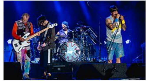
Red Hot Chili Peppers performing at the Ohana Music Festival in September 2019, three months before Klinghoffer was replaced by Frusciante

On December 15, 2019, the Chili Peppers announced that, after 10 years, Frusciante had rejoined, replacing Klinghoffer. They wrote that Klinghoffer was "a beautiful musician who we respect and love". [165] In an interview, Klinghoffer said there was no animosity: "It's absolutely John's place to be in that band ... I'm happy that he's back with them." [166] On November 2, the Chili Peppers performed their final show with Klinghoffer, at a charity event at the Silverlake Conservatory of Music in Los Angeles. [167] Klinghoffer released his debut solo album, To Be One with You , on November 22, 2019, featuring Flea and the former Chili Peppers drummer Jack Irons. [168]