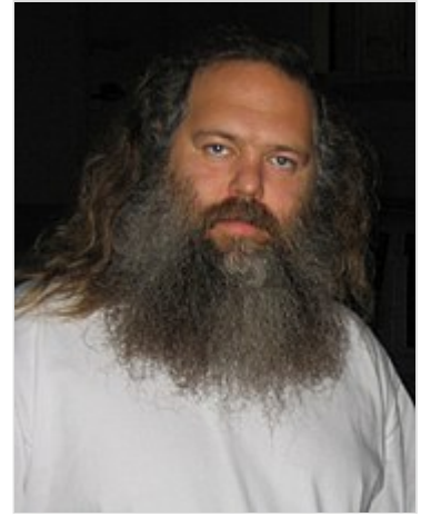
Rick Rubin has produced almost every Red Hot Chili Peppers album since 1991.

Without Frusciante, songs were written at a far slower rate. [77] Kiedis said: "John had been a true anomaly when it came to songwriting ... I just figured that was how all guitar players were, that you showed them your lyrics and sang a little bit and the next thing you knew you had a song. That didn't happen right off the bat with Dave." [77] With Kiedis often absent from recording due to his drug problems, Flea took on a larger role when he wrote and sang lead on "Pea". [78]