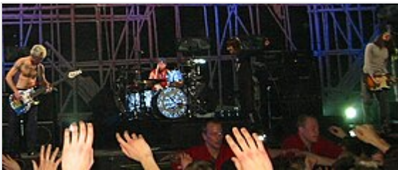
Red Hot Chili Peppers performing in Stockholm in 2003

The Chili Peppers began writing their next album in early 2001, immediately following the Californication tour. [104] Frusciante and Kiedis would collaborate for days straight, discussing and sharing guitar progressions and lyrics. [105] For Kiedis, "writing By the Way ... was a whole different experience from Californication . John was back to himself and brimming with confidence." [104] The recording was difficult for Flea, who felt his role was being diminished [106] and fought with Frusciante about the musical direction. [106] Flea considered quitting the band after the album, but the two worked out their problems. [107]