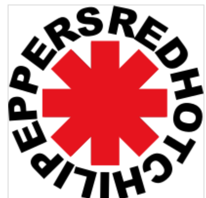
Red Hot Chili Peppers logo

In June 1999, after more than a year of production, the Red Hot Chili Peppers released Californication , their seventh studio album. It sold over 16 million copies, and remains their most successful album. [95] Californication contained fewer rap songs than its predecessors, instead integrating textured and melodic guitar riffs,