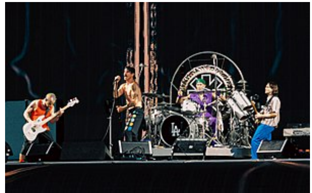
The band playing live in London in 2022. From left: Flea , Anthony Kiedis , Chad Smith , John Frusciante .