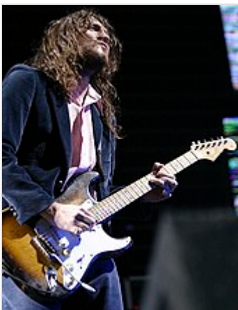
The band regained commercial success after guitarist John Frusciante (pictured in 2006) rejoined them in 1998. He left again in 2009 and rejoined in 2019.

With no guitarist, the Red Hot Chili Peppers were on the verge of breaking up. [87] In the years following Frusciante's departure, his heroin addiction had left him in poverty and near death. [88] Flea convinced Frusciante to enter Las Encinas Drug Rehabilitation Center in January 1998. [89][90] His addiction left him with scarring on his arms, a restructured nose, and dental implants following an oral infection. [91][92] In April 1998, Flea visited the recovered Frusciante and asked him to rejoin the band. Frusciante began sobbing and said nothing would make him happier. [93][94]