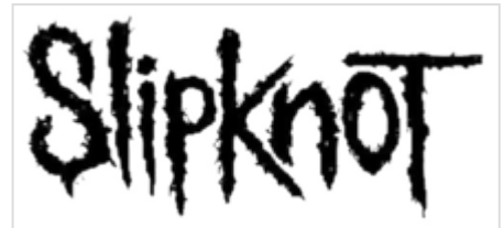
The band's logo