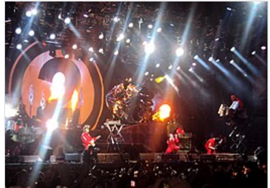
Slipknot at Soundwave Festival 2012

On September 25, 2016, the band performed at their annual festival Knotfest, which was altered to include Ozzfest this year. They performed the Iowa album in its entirety. [117] In the meanwhile, Crahan made his directorial debut with the feature film Officer Downe , based on a graphic novel of the same name and starring actor Kim Coates . [118] In November 2016, Slipknot percussionist Shawn "Clown" Crahan revealed during an interview with Rolling Stone that he and fellow guitarist Jim Root would be teaming up in February 2017 to begin writing new material for a new Slipknot album because "we want to write." [119]