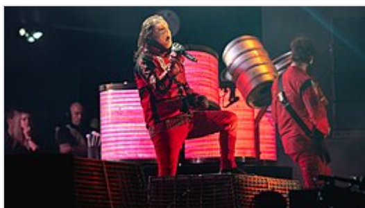
Slipknot performing in Peru in 2019