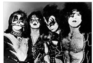
American hard rock band Kiss (pictured in 1976) is among Slipknot's influences.

The band Kiss has been a big influence for Slipknot, both musically and image-wise. Several band members have in numerous interviews stated the impact Kiss had on them when growing up. In an interview with Revolver magazine , Joey Jordison said that "I saw Kiss on The Dick Clark Show in like, 1980 or something, and Kiss Alive! was the first record of theirs I had. This was back when you bought cassettes or records, and I still have my original cassette copy of it. And I tell you what, it just blew my mind! The cover tells you everything you need to know; it just makes you want to listen to the whole fucking record. And these guys look like fucking demons — you don't know when you're a kid and you're watching them on TV that it's just guys in makeup. So yeah, it was inspiring back then. They were a huge influence on me when I was a kid. And that record came out in 1975, so I was always like, "That's fucking badass — one of my favorite records of all time came out the year I was born!". [200] In another interview with Loudwire , he also added that after listening to Kiss Alive! for the first, he was "changed forever, and then