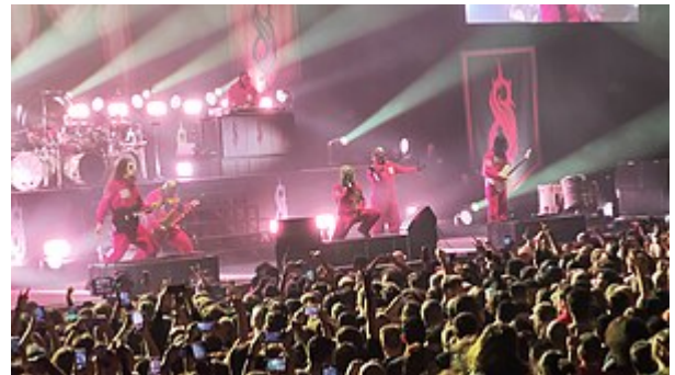
Slipknot performing live in the O2 Arena on December 21, 2024