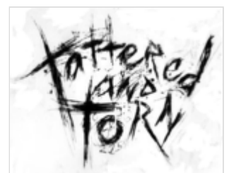
Slipknot's clothing brand logo

In 2008, Slipknot launched their clothing line Tattered and Torn . Named after a song on their 1999 self-titled debut, the line runs as an imprint of Bravado, a company that runs the band's merchandising. [263] While the band recognize that their merchandise is their biggest revenue income, they insist Tattered and Torn is more than just band merchandising. Vocalist Corey Taylor said, "It's a way for [the fans] to get cool clothing at affordable prices." [263] The first items from the clothing line went on sale in late July 2008 through Hot