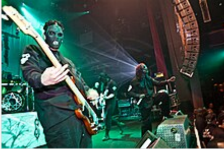
Slipknot performing in 2005

—Bassist Paul Gray , on Slipknot's third album [49]