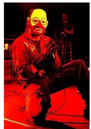
Mike Patton (pictured wearing a mechanic's jumpsuit and a clown mask with Mr. Bungle in 1991)

The members of Slipknot are also influenced by 1960s and 1970s hard rock and early metal acts including Black Sabbath , [200][215][222][193] Judas Priest , [223] Jimi Hendrix , [224] Kiss , [200][201][222][225] Led Zeppelin , [200][215][225] Queen , [226] the late 1970s and early 1980s new wave of British heavy metal bands Iron Maiden , [192] 1980s American thrash metal bands including Anthrax , [224][215][192] Megadeth , [192] Metallica , [200][215][201][192] Metal Church , [223] Slayer , [200][215][193][225] bands from the 1990s groove metal movement including Pantera , [192] Sepultura , [223] White Zombie , [192] the sludge metal bands such as Acid Bath , [227] The Melvins , [200] Neurosis , [228] as well as various black and death metal acts including Cannibal Corpse , [178] Deicide , [201][229] Dimmu Borgir , [225] Emperor , [225] Gorefest , [178] Malevolent Creation , [201] Mayhem , [215][225] Morbid Angel . [229] In addition the punk and new wave bands Black Flag , [222] The Clash , [230] Dead Kennedys , [222] Misfits , [178] the Police , [231] 1990s grunge and alternative rock bands Alice in Chains , [232] Pearl Jam , [233] the early hip hop acts such as the Beastie Boys , [229] N.W.A. , [234] Run-DMC , [229] and the industrial rock acts Nine Inch Nails , [228][229] Skinny Puppy , [229] have also been