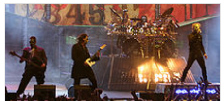
Slipknot performing in 2008. Paul Gray (left) died on May 24, 2010