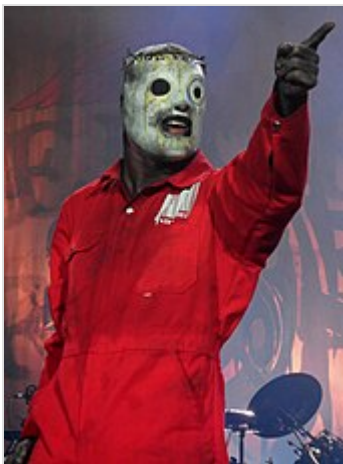
Corey Taylor performing with Slipknot in 2011