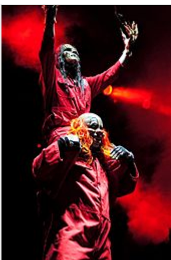
Shawn Crahan and Joey Jordison wearing variations of their masks while performing in 2012

The band is known for its attention-grabbing image; the members perform wearing unique, individual facemasks and matching uniforms—typically jumpsuits—while each member is typically assigned and referred to by number based on their role in the band (#0 through #8), although the latter practice has diminished following the death of Paul Gray. [20]