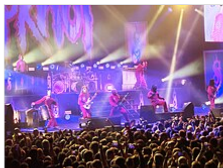
Slipknot performing live in the O2 Arena on December 21, 2024