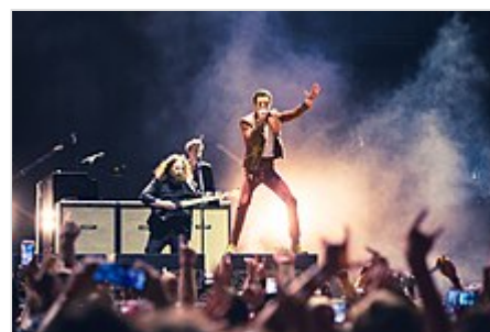
The Killers performing at Bonnaroo 2018

On January 14, 2019, the band released the standalone track, "Land of the Free", the official music video for which was directed by Spike Lee . [83] It was announced that the Killers would be performing at Woodstock 50 , though Woodstock 50 was canceled after a series of permit and production issues, venue relocations, and artist cancellations. [84][85]