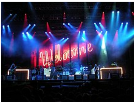
The Killers performing in 2009

" Human " was released in October 2008 with Flowers describing the song as " Johnny Cash meets the Pet Shop Boys ". The song became a hit worldwide. The lyric "Are we human, or are we dancer?" confused listeners, due to its grammar and ambiguity. Flowers explained that the line was inspired by a Hunter S. Thompson quote where he stated America was raising "a generation of dancers". It has since been voted by one poll as the most confusing song lyric of all time. [50]