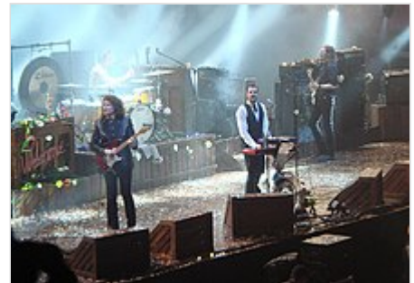
The band during their first arena tour in 2007.

The band recorded the video for the album's third single " Read My Mind " in Tokyo, Japan during a break in their Sam's Town Tour . The single release was accompanied by a remix of the song by the Pet Shop Boys . Due to high ticket demand, the Killers began headlining arenas including Madison Square Garden for the first time and also headlined a number of major European festivals during 2007, including Glastonbury Festival . [46]