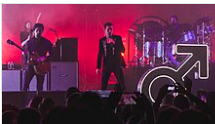
The Killers performing in September 2017

The Killers released their fifth studio album, Wonderful Wonderful , on September 22, 2017. [68] The album was produced by Jacknife Lee and lead single " The Man " was released on June 14, 2017. [69] [70] Before the album's release the band headed to Europe for a number of summer festival dates, including an unannounced set at Glastonbury Festival, where Stoermer joined them to perform on the John Peel Stage, the same stage they had performed on during their first appearance at the festival 13 years earlier. The run of shows concluded with a sold-out headline performance at the British Summer Time festival in London's Hyde Park. [71]