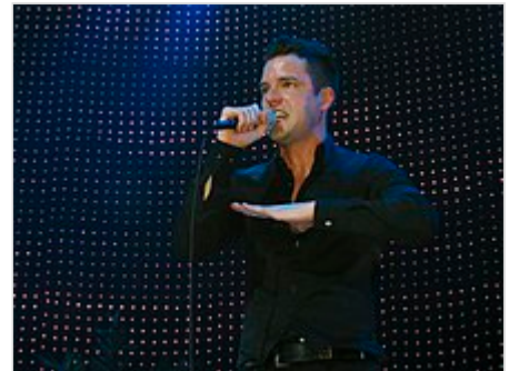
Brandon Flowers during the Day & Age World Tour

The band enlisted Stuart Price to produce their third studio album, he had previously remixed their songs under his Jacques Lu Cont moniker, the most notable being the remix of " Mr. Brightside ". They first met Price at his London home in 2007 to discuss the possibility of him producing some unreleased tracks for their b-sides album Sawdust , however that same night they ended up in Price's home studio recording a demo of " Human " a new song that would become the eventual lead single from Day & Age . The band took six months apart following the completion of their Sam's Town tour, during this period they would send song ideas between each other and Price via Logic Pro . The band finished recording the album with Price at the band's newly acquired Battle Born Studios in Las Vegas. [49]