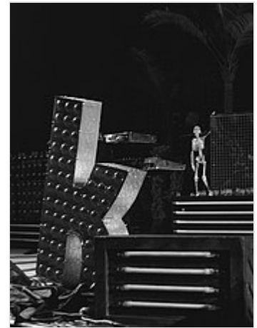
Set design for the Day & Age World Tour

In January 2010, the band announced that they would take a short break after being on the road for the better part of six years. [53] The break lasted for about a year and a half, during which band members devoted themselves on solo projects, while the band made sporadic other contributions. In late February 2010, Flowers' mother died from brain cancer. This resulted in the cancellation of dates in Asia. Two Australian dates in Sydney and Perth were also cancelled; however, both the Gold Coast and Melbourne concerts went ahead, with the Day & Age tour finally coming to a close in Melbourne on February 21 when the Killers were the headline act of the Good Vibrations Festival at Flemington Racecourse . [54]