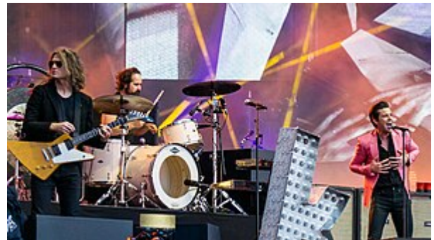
The Killers in 2017. From left to right: Dave Keuning , Ronnie Vannucci Jr. , and Brandon Flowers