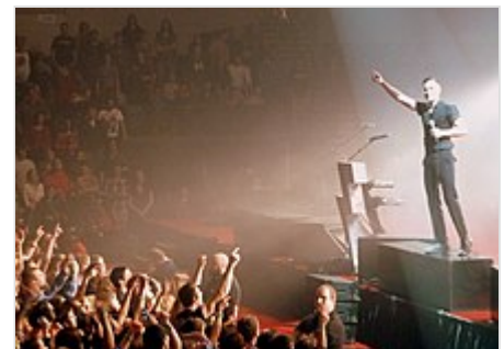
Brandon Flowers in 2012

The band headed back into the studio to record their fourth studio album in 2011, during the recording they worked with five producers Steve Lillywhite , Damian Taylor , Brendan O'Brien , Stuart Price and Daniel Lanois . [59] In June 2012, a short trailer was released on the Killers VEVO page, revealing the album's name Battle Born , [60] named after the flag of Nevada . This was followed by the release of lead single " Runaways " in July. That same month, they headlined Saturday night at the inaugural Firefly Music Festival in Dover, Delaware .