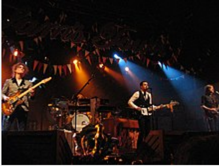
The Killers performing in October 2006

Flowers claimed he felt the band had made "one of the best albums of the past twenty years" and that he wanted the album to capture "everything important that got me to where I am today". In July 2006, the lead single " When You Were Young " was premiered and it became a hit, gaining another two Grammy Award nominations and mostly positive reviews with many bringing attention to the influence of heartland rock on the song.