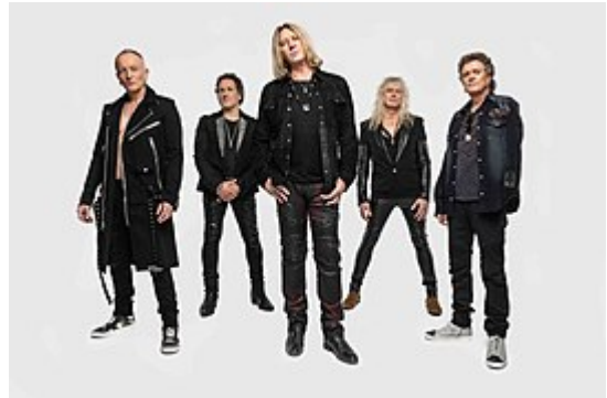
Def Leppard band members in 2018: Phil Collen , Vivian Campbell , Joe Elliott , Rick Savage , Rick Allen