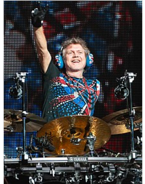
After losing his left arm in a car accident, drummer Rick Allen (pictured in 2018) used his feet to play a custom electronic drum kit .