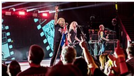
Def Leppard performing at a charity concert for the Teenage Cancer Trust held at the Royal Albert Hall in 2018.

throat for a month he might do permanent damage." [104] By July 2016, the band were performing regularly again and intended to complete 48 dates. [105] When the tour stopped at DTE Energy Music Theatre in Clarkston, Michigan , on 15 July, the show was recorded for future release. On 10 February 2017, the band released And There Will be a Next Time ... Live from Detroit , a double live album and concert video. [106] In August 2017, the band celebrated the 30th anniversary of Hysteria by releasing a collector's edition box. The singles were also re-released on vinyl. [107]