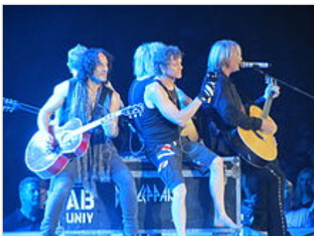
Def Leppard performing an acoustic set in Rosemont , 2012

After taking a year off from touring in 2010, the band announced on 22 February 2011 that they would be releasing their first live album in the summer. Mirror Ball – Live & More , a two-disc live album, with three new studio tracks. It was released in parts of Europe on 3 June, the rest of Europe on 6 June, and on 7 June in the US; it was announced at the same time that Def Leppard would perform at the Download Festival on 10 June 2011. [76] Of the three new studio tracks, two were released as singles, the first single being " Undeclared " released in April 2011. [77][78]