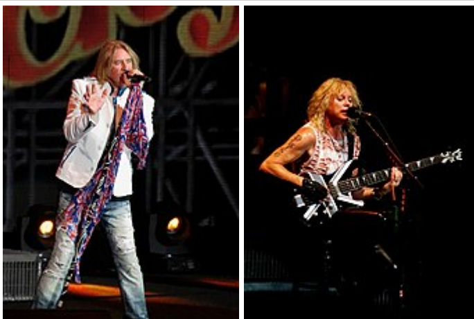
Vocalist Joe Elliott (left) and bassist Rick Savage (right), pictured in 2014, are the sole remaining original members of Def Leppard.