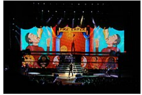
Def Leppard performing in Sacramento in September 2009.

band then returned to Europe before coming back for a second leg of the UK tour in June. The first of these dates was at the Glasgow SECC on 17 June. Again they were joined by Whitesnake; however, hard rock band Thunder supported at some of these shows. Black Stone Cherry continued to support most of the dates, including some of the Thunder ones. Six shows which were cancelled during the USA/Canada leg of their world tour due to illnesses affecting Joe Elliott and Phil Collen were rescheduled and played in August of that year. On 11 June, Def Leppard announced further dates for their 2008 World Tour. The extension saw them visit Japan, Australia and New Zealand. Whitesnake continued to support Def Leppard for their Indian and Japanese dates. Def Leppard toured 41 US cities plus Toronto during mid-2009 with Poison and Cheap Trick and also headlined the Download Festival at Donington Park , England to a sell-out crowd of 83,000 with Whitesnake and ZZ Top . [32]