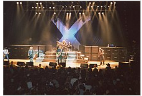
Def Leppard performing in Wolverhampton in February 2003.

On 5 September 2000, Def Leppard were inducted into Hollywood's RockWalk on Sunset Boulevard by their friend Brian May of Queen. [63] In 2001, VH1 produced and aired Hysteria – The Def Leppard Story , a biopic that included Anthony Michael Hall as Mutt Lange and Amber Valletta as Lorelei Shellist (Steve Clark's girlfriend). The docudrama covered the band's history between 1977 through 1986, recounting the trials and triumphs of Rick Allen and Steve Clark.