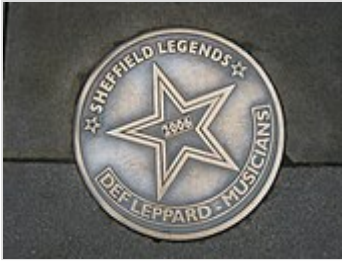
Sheffield Legends plaque in their home city of Sheffield, England, installed in 2006.

With Pyromania and Hysteria both certified Diamond by the RIAA , Def Leppard are one of only five rock bands with two original studio albums selling over 10 million copies each in the US, alongside the Beatles , Led Zeppelin , Pink Floyd , and Van Halen . [5] Both Pyromania and Hysteria feature in Rolling Stone 's list of the 500 Greatest Albums of All Time . [144][39]