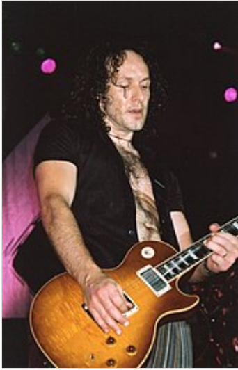
Guitarist Vivian Campbell in 2003. He joined Def Leppard in 1992.

including grunge . Amidst the increasing popularity of alternative rock, the band decided to balance their original image as rebellious rock stars with a slightly friendlier energy, combining heavy metal with melodies and hooks more reminiscent of pop music. [55][56] On 6 June 1993, Def Leppard performed the first ever rock concert at the Don Valley Stadium in their home city of Sheffield before an audience of over 50,000. [32]