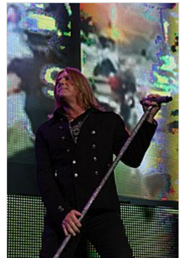
Joe Elliott is known for his distinctive raspy singing voice. [127]

In the mid-1980s, the band were associated with the growing glam metal scene, mainly due to their mainstream success and glossy production. [138] Pyromania has been cited as the catalyst for the 1980s pop-metal movement. [29] Def Leppard, however, expressed their dislike of the "glam metal" label as well, as they thought it did not accurately describe their look or musical style. [139] By the release of the Hysteria album, the band had developed a distinctive sound featuring electronic drums and effects-laden guitar sounds overlaid with a multi-layered wall of husky, harmonised vocals. According to Joe Elliott, Def Leppard are influenced by "everything from pure pop to downright hardcore rock". [140] He has cited Ian Hunter and Mott The Hoople among the band's early influences. [141] Def Leppard themselves have been cited as an influence by a wide range of musical artists, including Matt Nathanson [142] and Taylor Swift . [143]