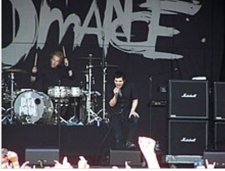
The band during the Big Day Out in February 2007