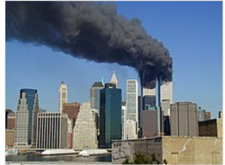
Witnessing the September 11 attacks influenced Gerard Way to form My Chemical Romance.