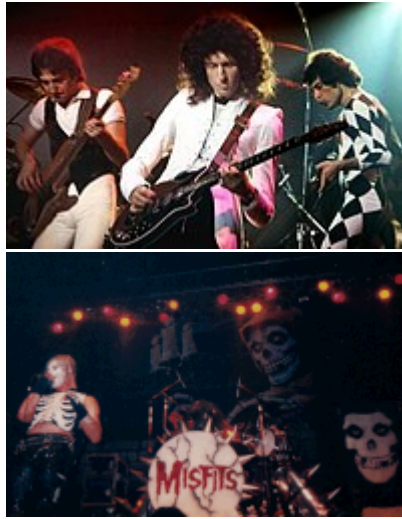
My Chemical Romance have cited Queen (top) and Misfits (bottom) as key influences.

"Fixation of Darkness", Idlewild's "Love Steals Us from Loneliness", Alkaline Trio's "Radio", Thrice's "Red Sky", Denali's "Surface", Soilwork's "Bastard Chain" and Helloween's "Twilight of the Gods". [237] Frank Iero's guitar work draws from Sonic