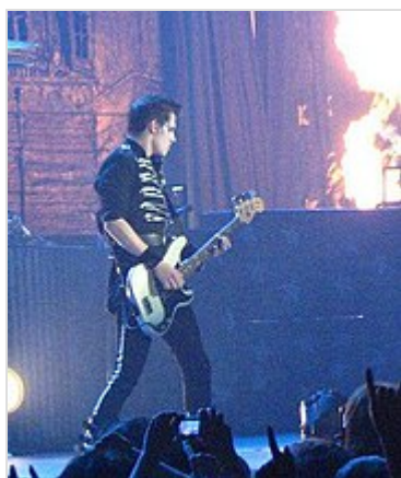
Bassist Mikey Way, dressed in his Black Parade uniform