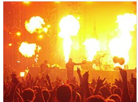
Most of the concerts on The Black Parade World Tour involved the use of pyrotechnics , especially during " Mama " and " Famous Last Words ".

In 2008, the band released a live DVD/CD collection titled The Black Parade Is Dead! , which includes two concerts from October 2007, the final Black Parade concert in Mexico, and a small show at Maxwell's in New Jersey. [56] The DVD/CD was meant to be released on June 24 in the United States and June 30 in the UK, but was postponed to July 1 because of a technical fault with the Mexico concert. [57] In 2009, an EP of B-sides from The Black Parade was released, titled The Black Parade: The B-Sides . [58] The band then announced that they would be releasing "a collection of nine never-before-seen live videos, straight from the encore set of the Mexico City show from October 2007" during their Black Parade World Tour , titled ¡Venganza! . The release came on a bullet-shaped flash drive. It was released on April 10, 2009. [59]