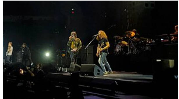
My Chemical Romance in Oklahoma City , 2022.

From left to right: Mikey Way , Frank Iero , Gerard Way , Ray Toro , Jarrold Alexander , and Jamie Muhoberac