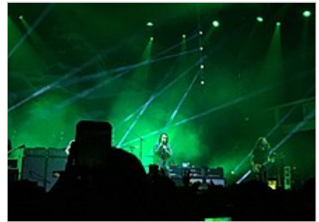
My Chemical Romance performing at their 2019 reunion show

On October 31, 2019, the band announced they would be reuniting in Los Angeles on December 20 and a new merchandise line. The announcement was accompanied by the captions "Return" and "Like Phantoms Forever...". [138][139][140] The show sold out almost immediately. [141] Believed initially to be a one-off show, almost a week later, the band announced more dates in Australia, Japan and New Zealand for 2020. [142] They later revealed that they had first regrouped in 2017 and had been working together since then, before the official 2019 announcement. [143][144][145] The concert grossed $1,451,745, with an attendance of 5,113. [146]