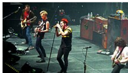
My Chemical Romance performing at a concert in 2011

Since Bryar's departure, My Chemical Romance has not had a full time drummer. [81] In a March 2010 MTV interview about the new album, Way explained, "There's no title yet ... I'm actually kind of excited about that. It's kind of 'anything goes' at this point, but I'm so happy with the songs." Though the band eventually decided on the title of their fourth album, it continued to go unannounced, with various rumors circulating and the band stating on their website that it will be revealed "all in due time". [82]