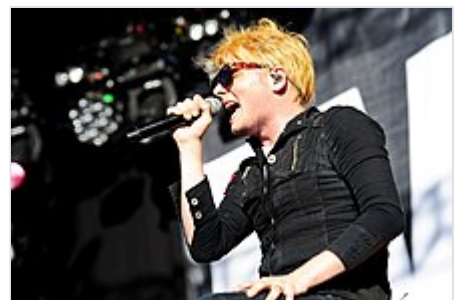
Gerard Way at the festival Big Day Out in February 2012 in Australia