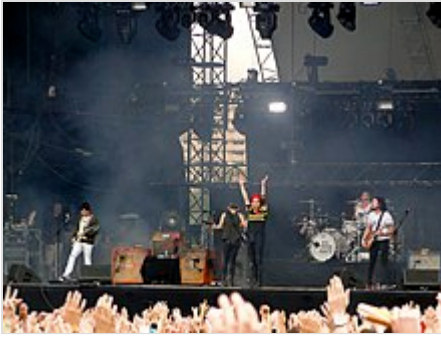
My Chemical Romance performing in 2011