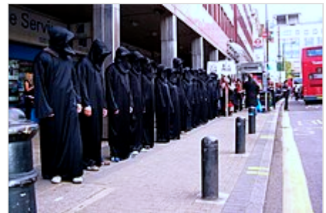
Announcement of The Black Parade at London Hammersmith Palais , 22 August 2006