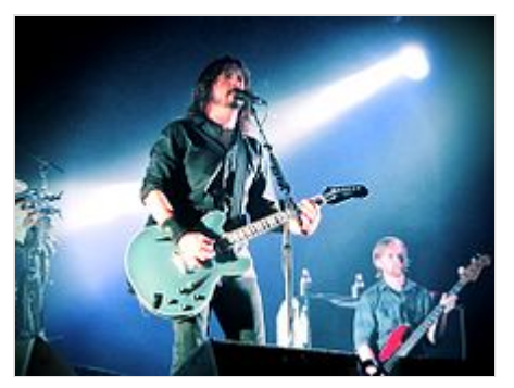
The Foo Fighters performing in December 2011

In September 2011 before a show in <u>Kansas City</u>, the band performed a parody song in front of a protest by the <u>Westboro Baptist Church</u>. It mocked the church's opposition to homosexuality and was performed in the same faux-trucker garb that was seen in the band's Hot Buns promotional video. [49][50]