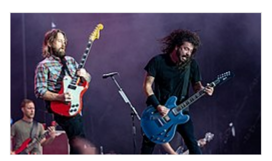
The Foo Fighters performing at Download Festival Paris in June 2018

The Foo Fighters have been described as alternative rock, [8][135][136] post-grunge, [137][138][139] hard rock, [140][141][142] grunge, [143][144] power pop, [145] and pop rock. [146] They were initially compared to Grohl's previous group, Nirvana. Grohl acknowledged that Kurt Cobain was an influence on his songwriting: "Through Kurt, I saw the beauty of minimalism and the importance of music that's stripped down." The Foo Fighters also used the technique of shifting between quiet verses and loud choruses, which Grohl said was influenced by the members of Nirvana "liking The Knack, Bay City Rollers, Beatles, and ABBA as much as we