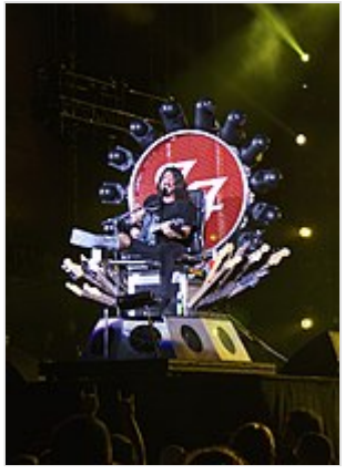
Grohl performing at Fenway Park in 2015 on a custom-built throne while recuperating from a broken leg

following month. The band confirmed touring keyboardist Rami Jaffee was officially the sixth member of the group. [95] On June 20, 2017, the band announced that their new album, Concrete and Gold , would be released in September. On August 23, 2017, "The Sky Is a Neighborhood" was released as the second single [96] and topped the Mainstream Rock chart. [97] The Line was released in promotion of the album and later as the third single in 2018. [98] Concrete and Gold was officially released on September 15, 2017, produced by Greg Kurstin. The album is noted as deriving influence from Pink Floyd, Led Zeppelin, and the Beatles. [99]