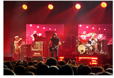
The Foo Fighters performing live in 2007

For the follow-up to In Your Honor , the band recruited The Colour and the Shape producer Gil Norton. Echoes, Silence, Patience & Grace was released on September 25, 2007. The album's first single, "The Pretender", was issued to radio in early August. In mid-to-late 2007 "The Pretender" topped Billboard 's Modern Rock chart for a record 19 weeks. The second single, "Long Road to Ruin", was released in December 2007, supported by a music video directed by longtime collaborator Jesse Peretz (formerly of the Lemonheads). Other singles included "Let It Die" and "Cheer Up, Boys (Your Make Up Is Running)".