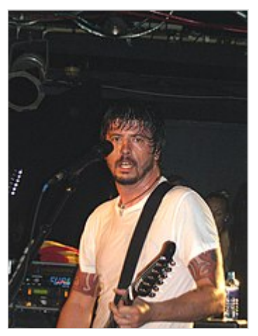
Grohl performing with the Foo Fighters in 2006

In further support of In Your Honor , the band organized a short acoustic tour for the summer of 2006. Members who had performed with them in late 2005 appeared, such as <u>Pat Smear</u>, <u>Petra Haden</u> on violin and backing vocals, <u>Drew Hester</u> on percussion, and <u>Rami Jaffee</u> of <u>The Wallflowers</u> on keyboard and piano. While much of the setlist focused on In Your Honor 's acoustic half, the band also used the opportunity to play lesser-