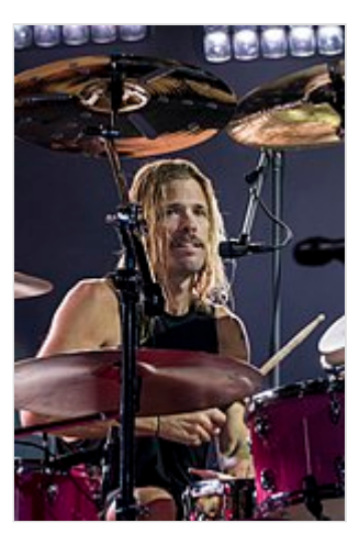
Long-time drummer Taylor Hawkins (pictured in 2017) joined the band in 1997.

Smear left the Foo Fighters in 1997, citing exhaustion and burnout, and was replaced by Grohl's former <u>Scream</u> bandmate <u>Franz Stahl</u>. [16] Stahl toured with the Foo Fighters for the next few months and appeared on two tracks recorded for movie soundtracks, a re-recording of "<u>Walking After You</u>", also released as a single, for The X-Files and "A320" for Godzilla . A B-side from