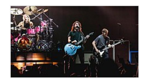
The Foo Fighters performing in 2017

Concrete and Gold also features Justin Timberlake<sup>[100]</sup> on vocals for "Make It Right", Shawn Stockman of Boyz II Men on backing vocals for the song "Concrete and Gold",<sup>[101]</sup> and Paul McCartney<sup>[102]</sup> on the drums for "Sunday Rain". The band began touring in June 2017,<sup>[103][104]</sup> including headlining the Glastonbury Festival 2017.<sup>[105]</sup> The tour in support of Concrete and Gold was extended to October 2018.<sup>[106]</sup>