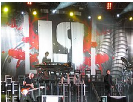
Linkin Park performing at Nova Rock Festival on June 17, 2007

Linkin Park returned to the recording studios in 2006 to work on new material. To produce the album, the band chose producer Rick Rubin . Despite initially stating the album would debut sometime in 2006, it was delayed until 2007. [65] The band had recorded thirty to fifty songs in August 2006, when Shinoda stated the album was halfway completed. [65][66] Bennington later added that the new album would stray away from their previous nu metal sound. [67] Warner Bros. Records officially announced that the band's third studio album, titled Minutes to Midnight , would be released on May 15, 2007, in the United States. [68][69] After spending fourteen months working on the album, the band members opted to further refine their album by removing five of