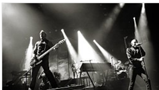
Linkin Park performing in Berlin in October 2010. From left to right: Joe Hahn , Dave Farrell , Brad Delson , Mike Shinoda , Rob Bourdon and Chester Bennington .

In July 2011, Bennington told Rolling Stone that Linkin Park aims to produce a new album every eighteen months, and that he would be shocked if a new album did not come out in 2012. [123][124] He later revealed in another interview in September 2011 that the band was still in the beginning phases of the next album, saying "We just kind of began. We like to keep the creative juices flowing, so we try to keep that going all the time ... we like the direction that we're going in". [125] On March 28, 2012, Shinoda confirmed that the band is filming a music video for "Burn It Down", [126] directed by Joe Hahn. [127] Shinoda spoke to Co.Create about the album's art, saying that it will "blow them [the fans] away ... the average person is not going to be able to look at it and go, I