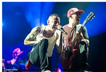
Bennington and Shinoda performing live in Montreal on August 23, 2014