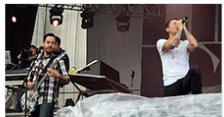
Linkin Park performing at Sonisphere Festival in Pori , Finland , on July 25, 2009

A Thousand Suns was released on September 14. [90][97] The album's first single, " The Catalyst ", was released on August 2. [98][99] The band promoted their new album by launching a concert tour, which started in October 2010. [100] Other singles from the album include, " Waiting for the End ", [101][102] " Burning in the Skies ", [103] and " Iridescent ". [104] Furthermore, a documentary about the album's production, titled