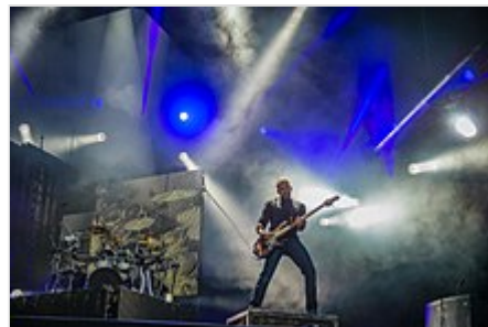
Dave Farrell performing with Linkin Park at Rock in Rio USA in 2014

The first single from the new album was revealed to be titled " Heavy "; it features pop singer Kiara , marking the first time the band featured a female vocalist on an original song for a studio album. The lyrics for the song were cowritten by Linkin Park with Julia Michaels and Justin Tranter . [191] The single was released on February 16. [192][193] As they have done in the past, Linkin Park had cryptic messages online in relation to the new album. The album cover was revealed through digital puzzles across social media; the cover features six kids playing in the ocean. [194] The band's seventh album, One More Light , was released on May 19, 2017. [195][196] The promotional singles, " Battle Symphony ", " Good Goodbye " (featuring Pusha T and Stormzy ), and " Invisible " were also released prior to the album's release. [197][198][199]