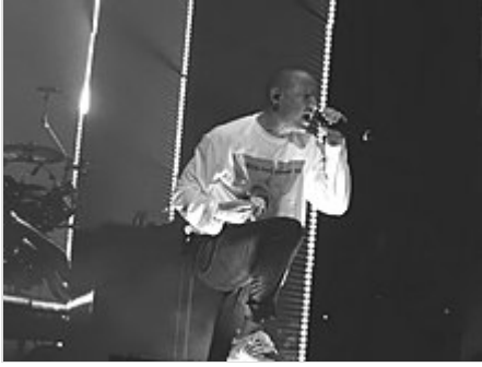
One of Bennington's final performances with Linkin Park on July 4, 2017, at the O2 Brixton Academy in London

Bennington died on July 20, 2017; his death was ruled a suicide by hanging . [200] Shinoda confirmed Bennington's death on Twitter , writing, "Shocked and heartbroken, but it's true. An official statement will come out as soon as we have one". [201] The band had released a music video for their single " Talking to Myself " earlier that day. [202] One day after Bennington's death, the band canceled the North American leg of their One More Light World Tour . [203] On the morning of July 24, Linkin Park released an official statement on their website as a tribute to Bennington. [204][205] On July 28, Shinoda announced that donations made to the band's Music for Relief charity would be redirected to the One More Light Fund , which had been set up in Bennington's memory. [206] On August 4, when the band was initially scheduled to play on Good Morning America ,