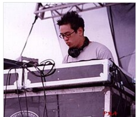
Joe Hahn performing with Linkin Park at Rock am Ring in 2001