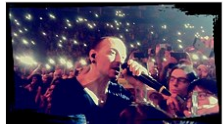
Bennington performing in a crowd of people with flashlights was used prominently in the music video for " One More Light " in the wake of his passing.

On August 22, Linkin Park announced plans to hold a tribute concert in Los Angeles to honor Bennington. The band thanked fans for their support, stating, "The five of us are so grateful for all of your support as we heal and build the future of Linkin Park". [209] The title track of One More Light was released as a single on October 3. [210] The band later confirmed that the concert, titled Linkin Park and Friends: Celebrate Life in Honor of Chester Bennington , would take place on October 27 at the Hollywood Bowl . [211][212] The event featured multiple guests performing Linkin Park songs along with the band. [213] The event was over three hours long and was streamed live via YouTube . [214] As of September 2024, it has 25 million views. [215]