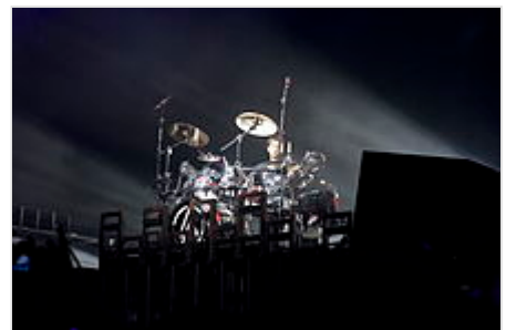
Rob Bourdon with Linkin Park on May 25, 2007, during their Minutes to Midnight World Tour

The album's first single, " What I've Done ", was released on April 2, [68] and premiered on MTV and Fuse within the same week. [72] The single peaked at no. 7 on the Billboard Hot 100 . [73] The song is also used in soundtrack for the 2007 action film, Transformers . [74][75] Mike Shinoda was also featured on the Styles of Beyond song " Second to None ", which was also included in the film. [75] Later in the year, the band won the "Favorite Alternative Artist" in the American Music Awards . [76] The band also saw success with the rest of the album's singles, " Bleed It Out ", " Shadow of the Day ", " Given Up ", and " Leave Out All the Rest ", which were released throughout 2007 and early 2008. The band also collaborated with Busta Rhymes on his single " We Made It ", which was released on April 29. [77]