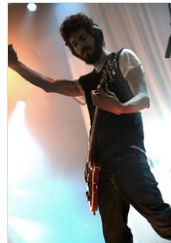
Brad Delson performing with Linkin Park on A Thousand Suns World Tour in 2010

The band charted in numerous Billboard Year-End charts in 2011. The band was No.39 in the Top Artists Chart, [115] No.87 in the Billboard 200 Artists chart, [116] No.11 in the Social 50 Chart, [117] No.6 in the Top Rock Artists Chart, [118] No.9 in the Rock Songs Artists Chart, [119] No.16 in the Rock Albums Chart, [120] No.4 in the Hard Rock Albums Chart, [121] and No.7 in the Alternative Songs Chart. [122]