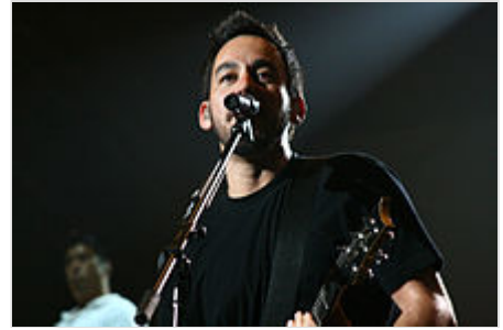
Mike Shinoda performing with Linkin Park in 2008 during the Projekt Revolution tour

Linkin Park embarked on a large world tour titled " Minutes to Midnight World Tour ". The band promoted the album's release by forming their fourth Projekt Revolution tour in the United States which included many musical acts like My Chemical Romance , Taking Back Sunday , HIM , Placebo , and many others. [78] They also played numerous shows in Europe, Asia, and Australia which included a performance at Live Earth Japan on July 7, 2007. [79] and headlining Download Festival in Donington Park, England [80] and Edgefest in Downsview Park , Toronto , Ontario , Canada . [81] The band completed touring on their fourth Projekt Revolution tour before taking up an Arena tour around the United Kingdom, visiting Nottingham , Sheffield and Manchester , [82] before finishing on a double night at the O2 arena in London. [83] Bennington stated that Linkin Park plans to release a follow-up album to Minutes to Midnight . [84] However, he stated the band will first embark on a United States tour to gather inspiration for the album. [84] Linkin Park embarked on another Projekt Revolution tour in 2008. [85] The United States Projekt Revolution tour featured Chris Cornell , the Bravery , Ashes Divide , Street Drum Corps and many others. [85] Mike Shinoda announced a live CD/DVD titled Road to Revolution: Live at Milton Keynes , which is a live video recording from the Projekt Revolution gig at the Milton Keynes Bowl on June 29, 2008, which was officially released on November 24, 2008. [86]