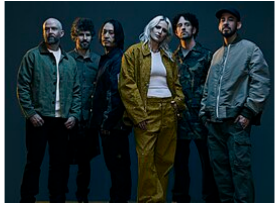
Linkin Park in 2024

From left to right: Dave Farrell , Brad Delson , Joe Hahn , Emily Armstrong , Colin Brittain , and Mike Shinoda