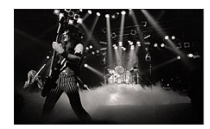
Iron Maiden on stage, <u>Killers World</u> Tour 1981