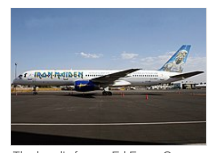
The band's former Ed Force One, a Boeing 757-200

For their <u>Somewhere Back in Time World Tour</u> in 2008 and 2009, Iron Maiden commissioned an <u>Astraeus Airlines Boeing 757</u> as transport. The aeroplane was converted into a <u>combi</u> configuration, which enabled it to carry the band, their crew and stage production, allowing the group to perform in countries which were previously deemed unreachable logistically. It was also repainted with a special Iron Maiden livery, which the airline decided to retain after receiving positive feedback from customers. [298]