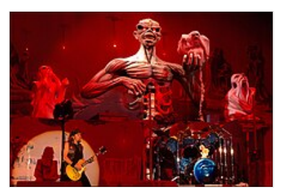
Iron Maiden's mascot <u>Eddie</u> in the background during a performance of "Seventh Son of a Seventh Son" in Madrid, May 2013

A large puppet version of Eddie has appeared many times during carnival celebrations in Rio de Janeiro and other South American cities. During the Cavalcade of Magi 2021 in the Spanish city of Cadiz, next to dolls representing characters known from the world of pop culture, there was a huge, inflatable mummy inspired by the image of the Iron Maiden mascot from 1985. [256][257][258]