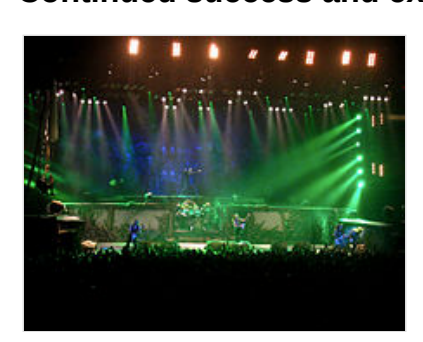
Iron Maiden militarian stage set presented on A Matter of Life and Death World Tour

At the end of 2005, Iron Maiden began work on <u>A Matter of Life and Death</u>, their fourteenth studio album, which was released in autumn 2006. War and religion are recurring themes in the lyrics and the cover artwork. The release was a critical and commercial success, marking the band's first top ten on the <u>Billboard 200</u> and debuting at number one in the album charts of 13 countries. The supporting tour saw mixed critical reception, but included the band's first performance in Dubai at the <u>Dubai Desert Rock Festival</u> for 25,000 people, followed by a concert in <u>Bangalore Palace</u> Grounds, the first of any heavy metal band in India. The band then played a string of European dates, including an appearance at <u>Download Festival</u>, their fourth headline performance at <u>Donington Park</u>, followed by a popoximately 80,000 people.