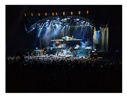
Iron Maiden in Chula Vista, CA, 2022

In February 2016, the band embarked on <u>The Book of Souls World Tour</u>, with shows in 35 countries across six continents, including their first performances in China, El Salvador, and Lithuania. It was the band's biggest album tour since 1996. [199] In total, Iron Maiden played 117 shows on six continents for well over two and a half million people. [200][29] The band then launched the <u>Legacy of the Beast World Tour</u> in Europe in 2018, [201] with North and South American shows following in 2019. The tour was inspired by the band's new mobile game and comic series released in 2017, entitled Legacy of the Beast . [202] The tour was received very positively by fans and critics, [203] spanning up to three years with 140 shows, performing to over 3.5 million fans.