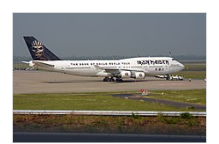
Iron Maiden's Ed Force One, a <u>Boeing 747-400</u>, as used during The Book of Souls World Tour in 2016

The aircraft, named "Ed Force One" after a competition on the band's website, \frac{[299]}{} was flown by Dickinson until 2022, \frac{[300]}{} as he