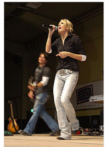
Underwood performing in Iraq in December 2006