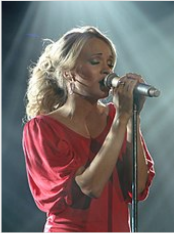
Underwood performing at the World Arena in December 2006

The album's second single, [39] " Jesus, Take the Wheel " was released to radio in October and later peaked at number one on the Billboard Hot Country Songs, topping it for six consecutive weeks, and at number twenty on the Hot 100. [40] The song sold over two million copies and was certified double Platinum by the RIAA. [41] Underwood's third single, " Some Hearts ", was also released in October, but exclusively to pop radio, peaking in the top thirty of the adult contemporary charts. " Don't Forget to Remember Me ", her fourth single, also proved successful, reaching number two on the Hot Country Songs chart. Later that autumn, Underwood's third country single, [39] " Before He Cheats ", hit number one on Billboard's Hot Country Songs, staying there for five consecutive weeks. [42] The song peaked at number eight on the Billboard Hot 100, achieving the slowest climb ever to the top ten of the Billboard Hot 100, breaking the record that was previously held by Creed from July 2000. [43] In February 2008, when it was certified double Platinum, "Before He Cheats" became the first country song to ever be certified multi-