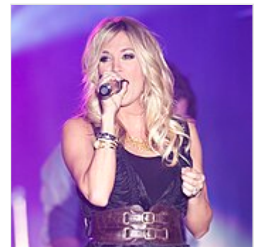
Underwood performing at the United States Naval Academy in April 2011