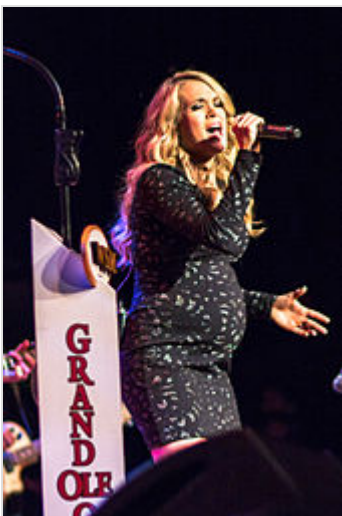
Underwood performing at the Grand Ole Opry in December 2014

Underwood confirmed that she began planning a new album in August 2013 and would start prep work sometime in 2014. [195] Underwood told Billboard , "After The Sound of Music , I feel like I can really buckle down and start working on the next album." Underwood also stated she has been planning another tour, which might be toned down from her earlier ones, stating, "I haven't thought about it much because I don't know what the next album is going to sound like, but I like just standing there and singing, too. I may take a different approach, a more simple approach on the next one. I loved the energy that rock concerts had", Underwood told Billboard . [196] Underwood was featured on " Somethin' Bad " from Miranda Lambert's album Platinum . [197] Released as a single, " Somethin' Bad " reached number one on the Hot Country Songs chart, becoming Underwood's 13th number-one on the chart. The same week, the song vaulted to number 19 on the Billboard Hot 100. [198]