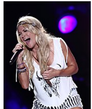
Underwood performing at the 2013 CMA Music Festival