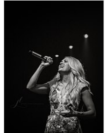
Underwood performs on the Cry Pretty Tour, September 2019