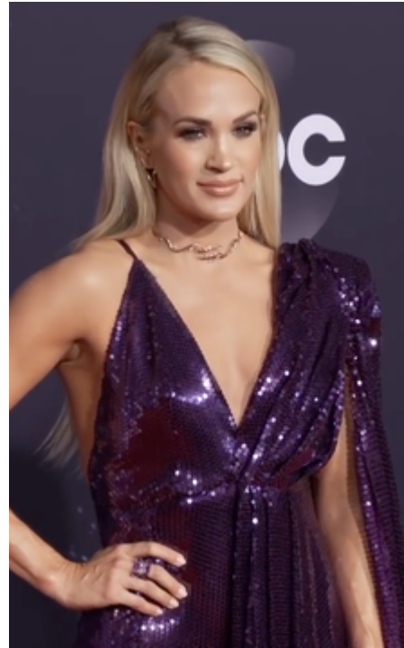
Underwood at the 2019 American Music Awards