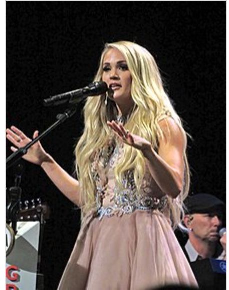
Underwood celebrating her ten-year anniversary of becoming a member of the Grand Ole Opry in 2018

Regarded as one of the most successful artists in any musical genre, [448][449] Underwood has sold 85 million records worldwide, as of 2023. [450] The Recording Industry Association of America recognizes Underwood as the tenth highest-certified female artist (all-genre) and the highest-certified female country artist of all time on its Top Artists (Digital Songs) ranking, with 47 million certified song units. [451][452] Underwood was also the highest-certified country album artist to debut in the 21st century (a record later surpassed). [453] In the US, she has sold 20 million albums and over 40 million singles, [454] making her the best-selling artist of the American Idol franchise, with Billboard calling her the ultimate Idol success story. [455][456] Forbes has declared Underwood the most successful American Idol winner of all time, with more albums sold and more revenue generated than any of the other contestants in the show's 15 seasons. [457]