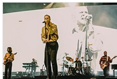
Imagine Dragons performing at Canada Life Centre during the Mercury World Tour in April 2022.

On March 11, 2022, the band released a single titled " Bones ", which serves as the lead single to the second part of their fifth studio album Mercury – Act 2 . [93] On April 6, the band announced that Mercury – Act 2 would be released on July 1, 2022. The second single, " Sharks ", was released June 24, 2022. The 18-track album was released as part of a compilation album containing both Mercury albums. [94]