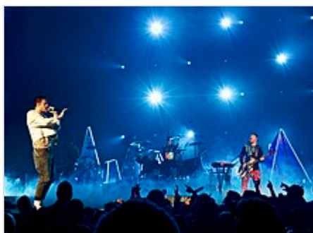
Imagine Dragons performing at Mohegan Sun during the Evolve tour in November 2017.

Imagine Dragons began recording their third studio album in September 2016. The band teased the upcoming album by posting cryptic messages on their Twitter account for the next four months. They released the song " Levitate ", recorded for the film Passengers , on December 2, 2016. On January 28, 2017, the band started posting a series of videos teasing the album's first single. [70] The time-lapse videos featured lead singer Dan Reynolds drawing surreal images on a drawing pad. Morse code was hidden in the videos and translated to "objects of same color".