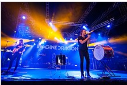
The band embarked on the Night Visions Tour in 2013.

The band finished recording their debut album Night Visions in the summer of 2012 at Studio X inside Palms Casino Resort and released the album in the United States on September 4, 2012. It peaked at No. 2 on the Billboard 200 chart with first week sales in excess of 83,000 copies, the highest charting for a debut rock album since 2006. [41] The album also reached No. 1 on the Billboard Alternative and Rock Album charts as well as the top ten on the Australian, Austrian, Canadian, Dutch, German, Irish, Norwegian, Portuguese, Scottish, Spanish, and United Kingdom Albums charts. It won a Billboard Music Award for Top Rock Album and was nominated for the Juno Award for International Album of the Year . [42] Night Visions is certified platinum in the US by the RIAA as well as in Australia, Austria, Brazil, Canada, Mexico, New Zealand, Poland, Portugal, Sweden, Switzerland, and the UK. The album produced three tracks that reached the Billboard Top 40 , four tracks in the ARIA Top 40 , and five tracks charting in the UK Top 40 .