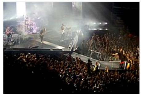
Imagine Dragons at Verizon Center , Washington, D.C., on the Smoke + Mirrors tour in July 2015

During the band's tour, Imagine Dragons released two non-album singles. " Roots " was released on August 26, 2015, and " I Was Me " on October 12, 2015, via iTunes . The band also released a cover of "I Love You All the Time" by Eagles of Death Metal on December 18, 2015, in support of the victims of the