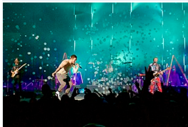
Imagine Dragons at Mohegan Sun in 2017. Left to right: Wayne Sermon , Dan Reynolds , former drummer Daniel Platzman , and Ben McKee .