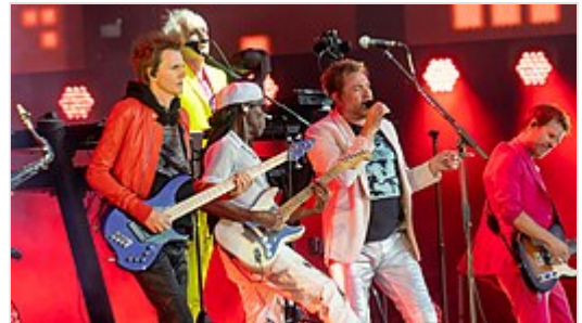
Duran Duran performing at BST Hyde Park 2022, with Nile Rodgers

In 2019, Duran Duran were working on a new album with Ronson, Erol Alkan and Giorgio Moroder handling production duties, and Graham Coxon and Lykke Li being confirmed as collaborators. Rhodes described the content and sound of a possible first single to be "very different for us." Initially planned for release in 2020, [88][89] the recording of the album was put on hold in March 2020 due to the COVID-19 pandemic . [90]