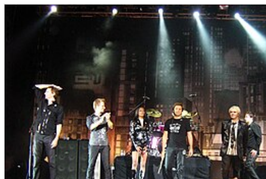
Duran Duran in Bogotá, Colombia, 2008