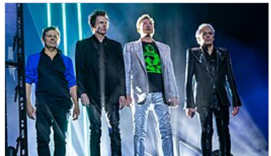
Duran Duran at The O2 Arena in London, 2023

The first single – the title track "Danse Macabre" – was released on 30 August 2023. The second single, "Black Moonlight", followed on 21 September. [108][109]