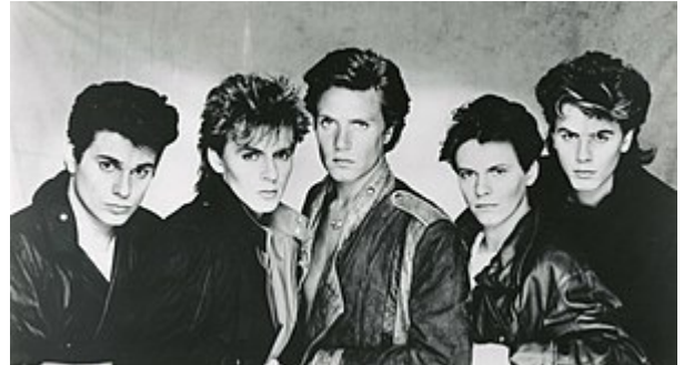
Duran Duran in 1983. Left to right: Roger Taylor (drums), Nick Rhodes (keyboards), Simon Le Bon (vocals), Andy Taylor (guitar) and John Taylor (bass)