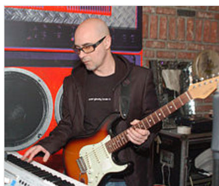
After contributing to the band for three years, Warren Cuccurullo (pictured in 2009) was made a full-time member of Duran Duran in 1989.