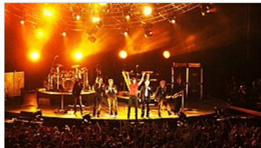
Duran Duran in New York City, 2005

The pace picked up with a sold-out tour of America, Australia and New Zealand. The band played a full concert at a private tailgate party at Super Bowl XXXVIII , their performance of "The Wild Boys" broadcast to millions during the pre-game show. A remix of the new track " (Reach Up for The) Sunrise " was released on many TV shows in February while magazines hailed (the modern "Fab Five") Duran Duran as one of the greatest bands of all time. [68] Duran Duran then celebrated their homecoming to the UK with fourteen stadium dates in April 2004, including five sold-out nights at Wembley Arena . The British press, traditionally hostile to the band, accorded the shows some very warm reviews. [69] Duran Duran brought along band Goldfrapp and the Scissor Sisters as alternating opening acts for this tour. [66] The last two shows were filmed, resulting in the concert DVD Duran Duran: Live from London which was released in November.