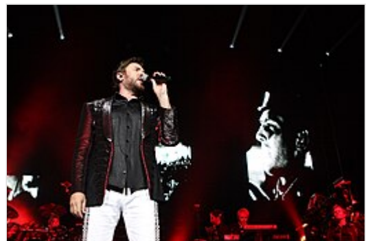
Duran Duran performing live at the Sydney Entertainment Centre , Australia, 2012

The band departed from Epic Records in 2009, after releasing just two albums. In early 2010, it was revealed that the band would be contributing a cover of " Boys Keep Swinging " to a tribute/charity record for David Bowie called We Were So Turned On from which all profits go to War Child . Other contributing artists included Carla Bruni , Devendra Banhart , Edward Sharpe & the Magnetic Zeros , and Warpaint . The album was released on 14 September 2010 on Manimal Vinyl Records. A limited edition split 7-inch single with Duran Duran and Carla Bruni was also released on Manimal Vinyl in December 2010.