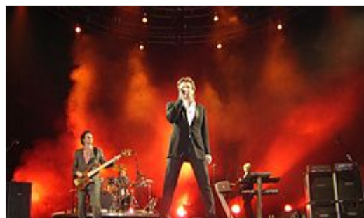
Duran Duran performing live at Scotiabank Arena in Toronto , Canada, 2005

In 2000, Le Bon approached John Taylor with a proposal to reform Duran Duran's classic line-up. They agreed to part company with Cuccurullo after completing the Pop Trash tour. Cuccurullo then announced on his website that he was leaving Duran Duran to resume work with his 1980s band Missing Persons . This announcement was confirmed the next day by Duran Duran's website, followed a day later by the news that John, Roger and Andy had rejoined. To fulfill contractual obligations, Cuccurullo played three Duran Duran concerts in Japan in June 2001, ending his tenure in the band.