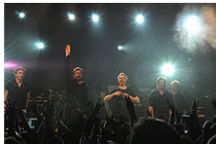
Duran Duran at SXSW in Austin, Texas , 2011