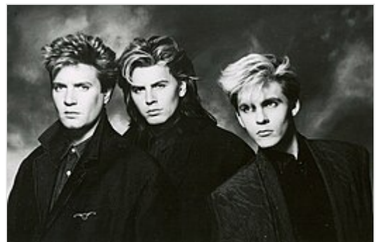
Duran Duran as a trio, in 1986

Without a guitarist or a drummer, Le Bon, Rhodes and John Taylor had producer (and former Chic guitarist) Nile Rodgers play a few tracks on guitar, and hired Steve Ferrone to play drums while they searched for replacements. In September 1986, Warren Cuccurullo (formerly of Missing Persons and Frank Zappa's band) was hired as a session guitarist. [51] With Le Bon, Rhodes and John Taylor, he recorded the rest of the Notorious album, which was released in October 1986. The black-and-white documentary film Three to Get Ready chronicled the recording of the album, legal tensions, and preparations for the tour.